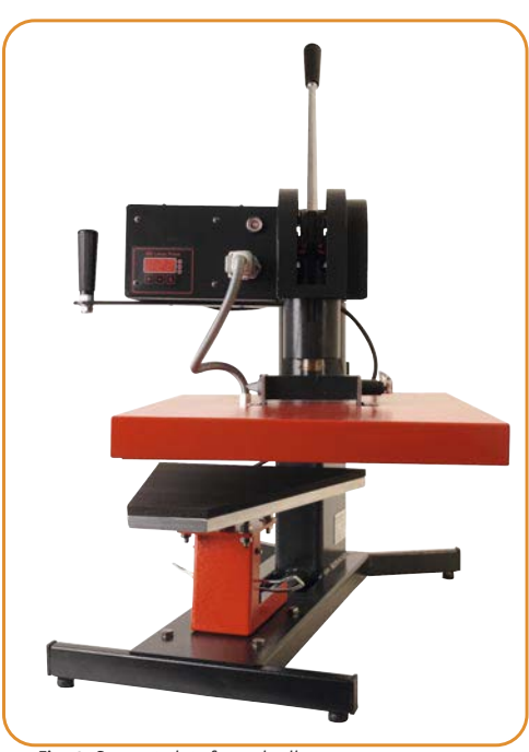
Fig. 6 · Support plate for umbrellas

All cap sets (Fig. 1) allow adjustment of the pressure shoe by moving support plate back and forth. This indispensible feature makes it possible to compensate for different forehead heights of caps: adjustment of the shoe allows optimum positioning under the bent heating plate.