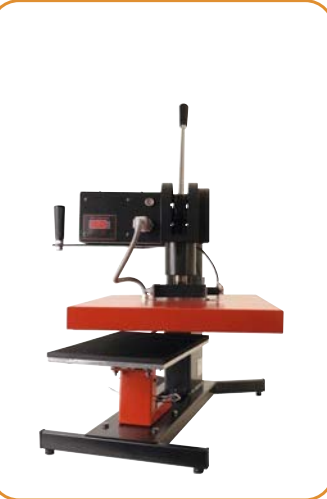
Fig. 4 · Support plate for girlie t-shirts, lengthwise