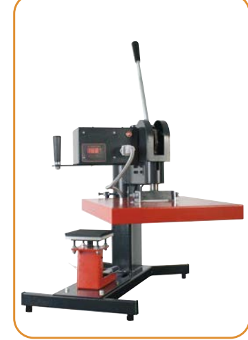
Fig. 2 · Breast pocket printing plate