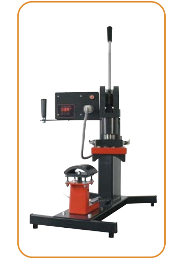
Fig. 1 · Optional cap set