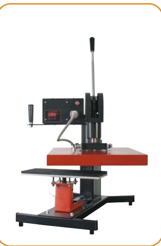
Fig. 3 · Support plate for sleeves or trouser legs crosswise