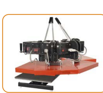
Abb. 5 · Wide swivel range for easy positioning of textiles