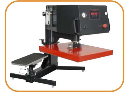
Fig. 1 - Support plates for sleeves or trouser legs - crosswise