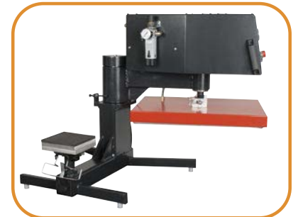
Fig. 2 - Support plate for breast pockets

LTS 550 and LTS 560 are perfect heat transfer presses for manufacturers of sporting goods, team suppliers, and workwear garment manufacturers.