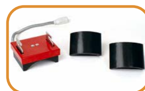
Fig. 6 · Cap set