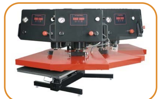
Fig. 4 - Wide swivel range for easy positioning of textiles