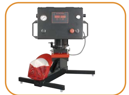
Fig. 3 - Cap set