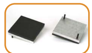
Fig. 7 · Support plates for breast pockets